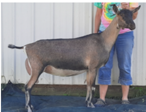
Birthday Gift, dam of Lot 53