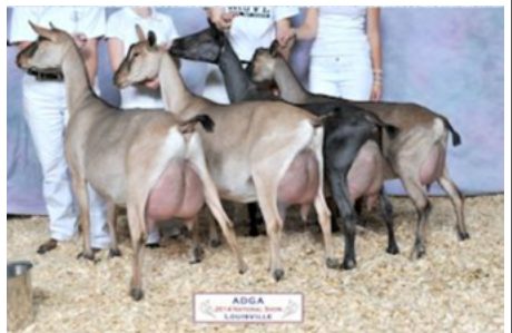
2014 National Show 1st Place Alpine Dairy Herd