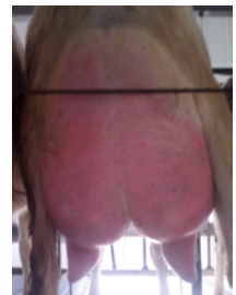
Lot 20 Farm

2023 Peak Prod: 13.3 Adults CAE tested Neg - Kids CAE prev, vac with BarVac CDT and poured.