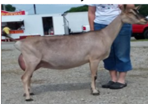
Solar Eclipse, dam of Lot 55