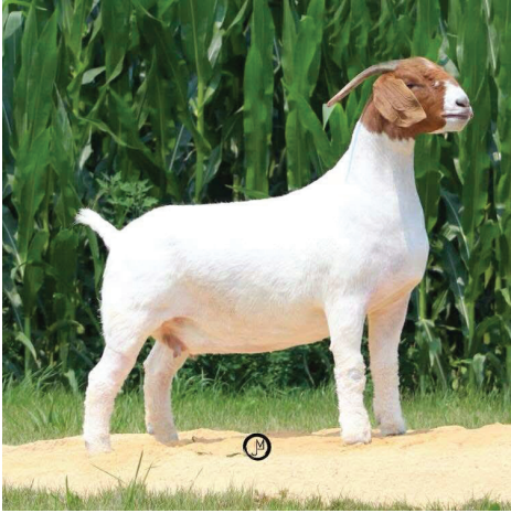
Blac Coco - Dam of Lot 3